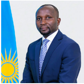
Dr. Ildephonse Musafiri Minister of Agriculture and Animal Resources, Rwanda